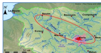
The tributaries and effected areas on both the Seine and Marne Rivers

consequences led levee managers to reinforce levees and to improve their monitoring, inspection and maintenance proceedings.