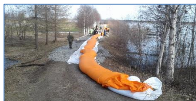
Temporary raising flood embankments in Tornio.

Every spring the melting snow causes flooding in Finland. This year the flood situation was fierce and caused trouble especially in Southern Ostrobothnia (Finland) in April and in Northern Finland in May. Many roads were closed and flood embankments were in high use. In some rivers, the excess flow was rerouted into fields to prevent serious damage. Severe flooding was expected in Northern Finland and flood embankments were raised to be on the safe side. Luckily, the predicted rain did not appear.