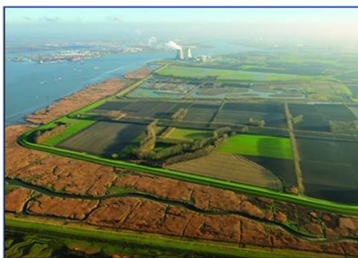
Aerial photograph of the Hedwige-Prosper Polder along the left bank of the (Wester)Scheldt just downstream of Antwerp.

Adaptation to the effects of climate change is a high priority in many countries, and the Netherlands and Flanders are no exception. In the Netherlands, the report 'Working Together with Water: A Living Land Builds for its Future' by the Second Delta Committee (2008) has given rise to many new ideas and innovative developments in the domain of flood protection policy. Flanders has incorporated its ideas on flood protection under climate change in its Flemish Adaptation Plan, the Sigma Plan and Integrated Coastal Safety Plan. The updated Sigma Plan (2005) designates particular expanses along the River Scheldt for reconstruction as water storage areas, in order to protect other places along the river from flooding. One of the ideas put forward is to make levees more resistant to overflowing (or overtopping). This is in line with the spatial adaptation objective of increasing the area available for water storage during extreme events – and in doing so, capping off high water peaks.