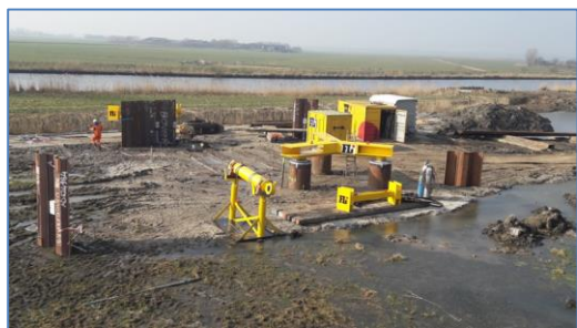
Sheet pile push over tests

The climate is changing, the sea level is rising and the Netherlands are subsiding. Never before has the Netherlands been faced with the need for such a major programme of dike upgrades. Recently the standards have been made stricter and so one third of the primary Dutch dikes now fail to meet the new safety requirements. A total of no less than 1,100 km will require strengthening between 2018 and 2028. That can only be achieved within budget and with the minimum impact for people living on and near the dikes, by using smart, innovative solutions.