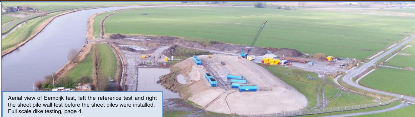
Aerial view of Eemdijk test, left the reference test and right the sheet pile wall test before the sheet piles were installed. Full scale dike testing, page 4.