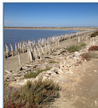
Figure 1: The existent dike near the site of the future platform Digue2020

The construction of DigueELITE platform was completed on August 2015 and the Digue2020 platform will be built in 2019. In DigueELITE program, the experimental dike is part of the rehabilitation work of the dike network along the river Vidourle. The dike is located in the Vidourle floodplain, along a meander. In Digue2020 program, the experimental platform will be located in a marine environment, in the regional natural reserve of Camargue. This platform will be built on an existent dike (Figure 1).