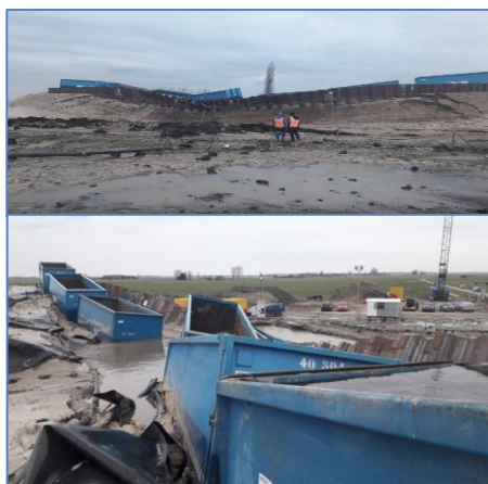
Test view, after failure of the sheet pile wall

A reinforced dike with a sheet pile wall is tested at Eemdijk in The Netherlands. This full scale test studies how dikes behave in extreme conditions such as high water levels in, under and along the dike. Sheet pile walls in dikes are the most common option for not removing nearby houses in a densely populated country like The Netherlands. However, sheet pile walls are relatively expensive compared with berm solutions. The sheet pile wall test will allow us to optimise the type and thickness of the sheet piles, resulting in major savings in the dike reinforcement projects.