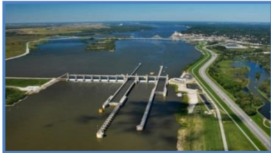
St Louis Levee System

The exercise was devised and developed between the 3 agencies to learn about, and compare, how the 3 countries assess the risk associated with their flood assets, by applying all 3 methods to the same levee (see Figure 1). It included a site visit to the chosen levee in St Louis, USA (chosen due to known concerns which yielded interesting assessment and comparison), followed by three one day workshops. Each country lead one workshop, demonstrating and taking all attendees through their method for assessing the risk of that levee. A peer review of each country's presented methodology was then completed. The exercise finished with a wrap up session to discuss and compare results and methods.